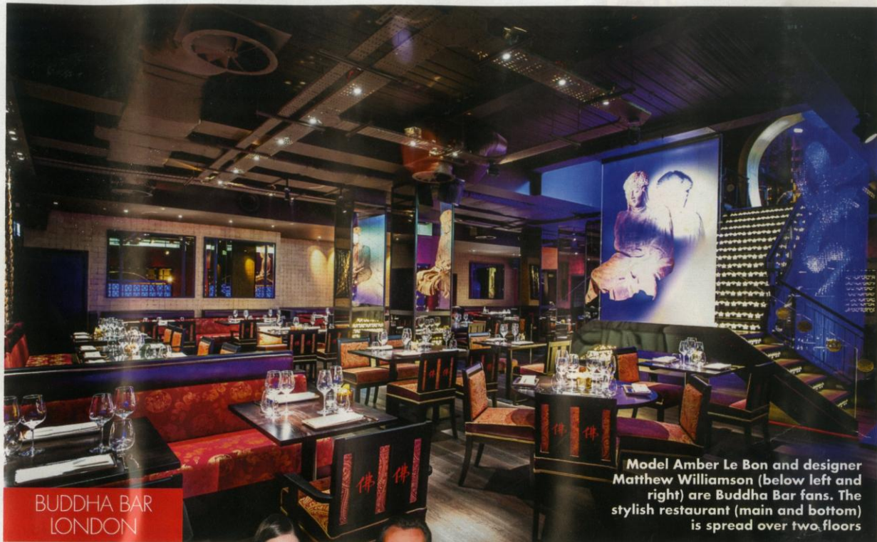
BUDDHA BAR LONDON