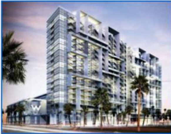
The W South Beach is located at 2201 Collins Avenue, Miami Beach, FL 33139; (305) 531-5535

You won't have to travel far if you dine at Mr. Chow's prior to joining the W South Beach's fantastically vibrant New Year's Eve celebration with performances by Kid Cudi and a musical interlude by John Legend. Annalynne McCord will be hosting the evening which starts at 9 p.m. all the way through to 5 a.m. the next morning and guests can enjoy Grey Goose cocktails all evening. Tickets for this event cost $300 per person and include an open bar from 9 p.m. until midnight with a midnight toast. VIP table reservations are starting at $2,000 if you're really looking to start your year in South Beach style.