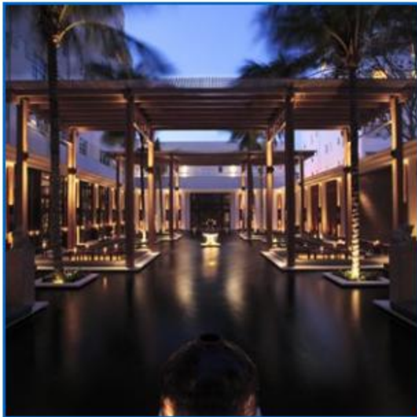
The Setai is located at 2001 Collins Avenue, Miami Beach, FL 33139; (305) 520-6400